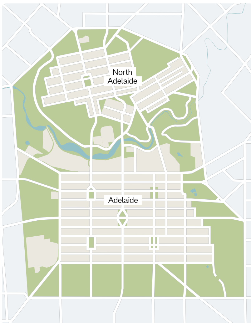
AEDA supports the economic growth in the city (postcodes 5000 and 5006)

This Business Plan and Budget is prepared in accordance with Section 6.2 of the AEDA Charter, which requires AEDA to produce an annual business plan and budget consistent with the Charter and submit to Council for approval.